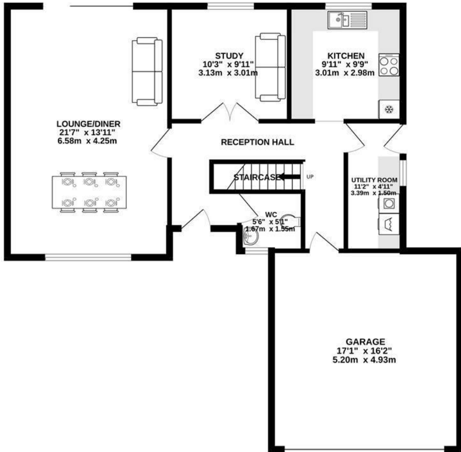
GROUND FLOOR 987 sq.ft. (91.7 sq.m.) approx.